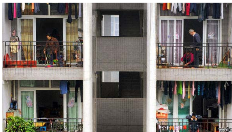
But will they consume enough?

CHINA'S LEADERS ARE usually shy of telling things as they are, but the prime minister, Wen Jiabao, put it bluntly when he described China's economy in 2007 as "unstable, unbalanced, unco-ordinated and unsustainable". Some foreigners may extol China's handling of the global financial crisis, but Mr Wen has stuck to his guns. The phrase even crops up in China's recently adopted five-year economic plan, standing out as an indirect admission of the failings of his own administration and as a marker for the next.