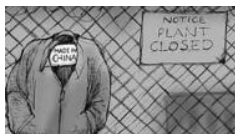
Where the jobs are