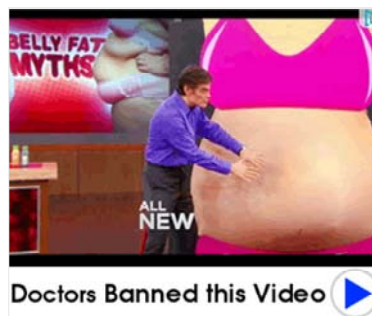
Doctors Banned this Video

Many consider this shift toward work to be a victory in itself, but it has to be considered against some hard facts about changes in the labor market since the War on Poverty began. The real value of wages for full-time male workers at the bottom of the earning distribution fell by more than 15% between the 1970s and the mid-1990s, rebounding only