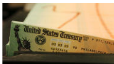
'Youth Social Security': An argument for payouts to young people