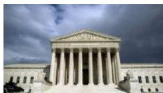
Let history rule on recess appointments