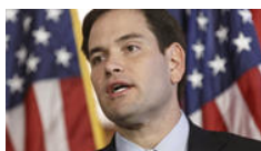
The GOP discovers inequality

People eat dinner at a soup kitchen run by the Food Bank For New York City. The food bank distributes dry, canned and fresh food to needy residents and works with community based member programs to provide some 400,000 free meals per day throughout New York City. Need increased in November when 47 million low-income people nationwide saw their food stamps cut as the federal SNAP program expired. (December 11, 2013)